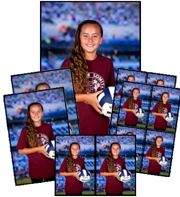
5 - JUST INDIVIDUAL PHOTOS includes 1 - 8x10, 2 - 5x7, 2 - 3½x5 & 4 wallets