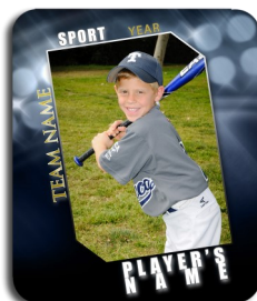
27 - MOUSE PAD features player's name, team, sport & year