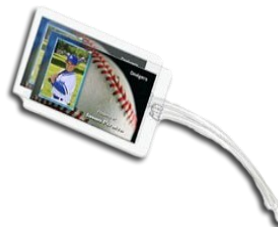
29 - BAG TAGS (SET OF 2) feature player's name, team name and year