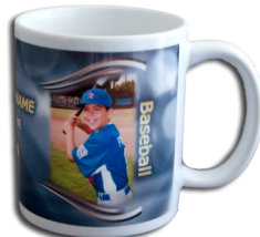
23 - CERAMIC PHOTO MUG features player's name, team, sport & year