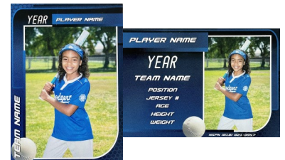
21 - TRADING CARDS (SET OF 16) double-sided cards feature player's stats and customized with template for your sport! Must fill out Trader Card Data box on front of form.