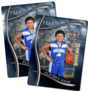
22 - PHOTO MAGNETS (SET OF 2) feature player's name, team, sport & year