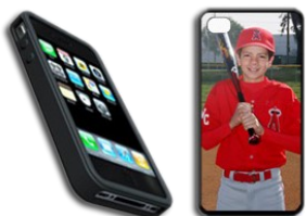
26 - CELL PHONE CASE Only iPhone & Samsung Galaxy "S" series cases available. Specify brand & model on front of form