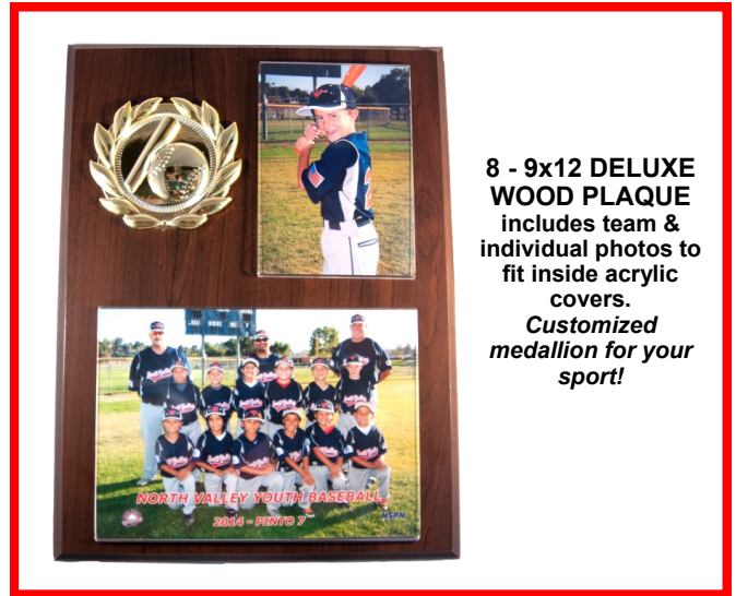
8 - 9x12 DELUXE WOOD PLAQUE includes team & individual photos to fit inside acrylic covers. Customized medallion for your sport!