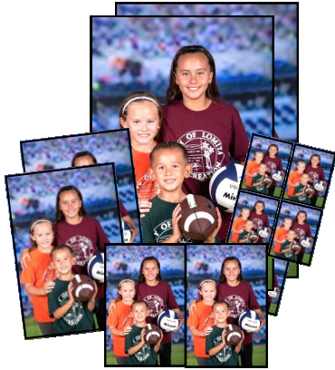
4 - JUST BUDDY/ FAMILY PHOTOS (2 or more people in photo) includes 2 - 8x10, 2 - 5x7, 2 - 3½x5 & 4 wallets

PRODUCTS WILL BE CUSTOMIZED TO YOUR SPORT. DIGITAL DESIGN MAY VARY FROM SAMPLES BELOW.