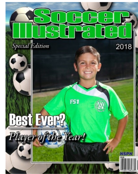
16 - 8x10 MAGAZINE COVER PHOTO customized with template for your sport