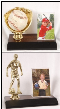
10 - DESK FRAME holds your wallet photo & includes gold sports figure (glove for baseball/ softball - does not include ball)